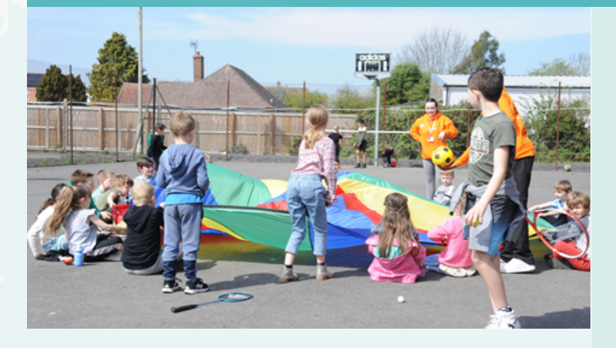
Overall FUEL figures for 2021/2022 below:

Our first delivery period of 2022 included the provision of ten core activity camps to over 700 unique participants during the Easter holidays in Wiltshire towns with the greatest number of eligible FSM recipients and two SEND specific camps. Over the four days the FUEL camps reached 2,130 total visits and provided 3,720 meals .